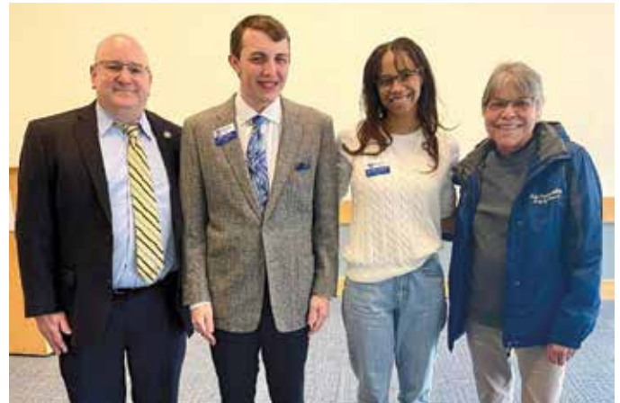
I enjoyed meeting with engaged student members of the Abington Social Change Initiative at Penn State Abington to discuss our state government.