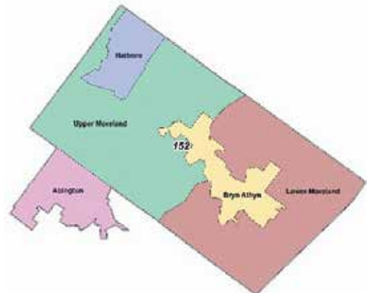
NEW 152ND LEGISLATIVE DISTRICT AFTER DECEMBER 1, 2022