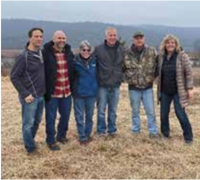
My colleagues from the Game and Fisheries Committee and I visited the Snow Geese and Black Ducks at the Middle Creek Wildlife Management Area.