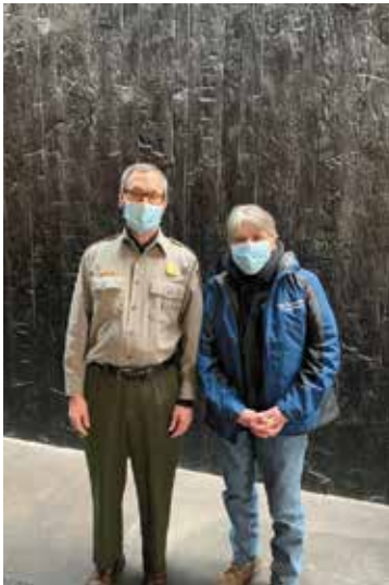
Paying my respects at the Flight 93 National Memorial in Stoystown, PA.