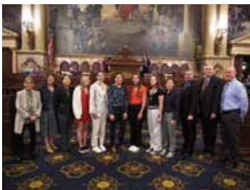
I was honored to welcome to the State Capitol this spring the Hatboro-Horsham Girls Swim Team, first time winners of the AAA State Championship.