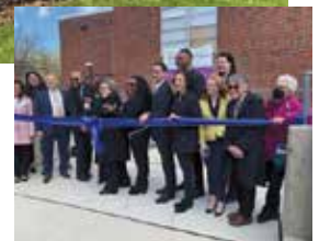
I attended the ribbon cutting for the new food cupboard at Salem Baptist Church in Abington.