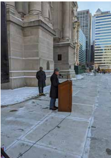
I spoke at the Asian Justice Rally in Philadelphia to advocate for equal rights and treatment for our AAPI community.