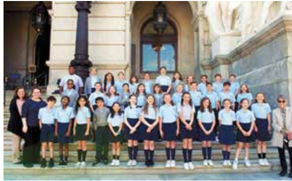
I was pleased to welcome the Queen of Angels Regional Catholic School's 4th grade class during their visit to the Capitol.