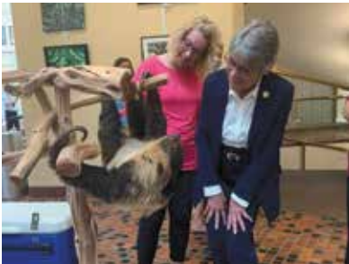
Just hanging around with Bean the Sloth from the Lehigh Valley Zoo during a recent visit to the Capitol.