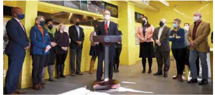
Our state minimum wage of $7.25 is currently the lowest in the region. Recently, I met with Governor Tom Wolf and other legislators in support of the workers at '&Pizza' in the Willow Grove Mall.