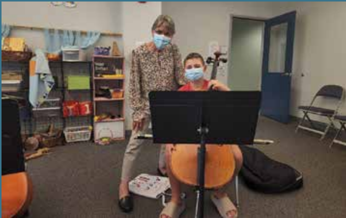
My staff and I had an opportunity to tour Settlement Music School's Willow Grove location. It was such a joy to watch bright young minds of tomorrow being taught and guided by world-class instructors. Settlement provides financial aid to more than 60% of their student population ensuring that arts education is accessible to all.