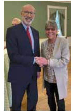
I met with Gov. Tom Wolf in preparation for this year's work on the state budget.