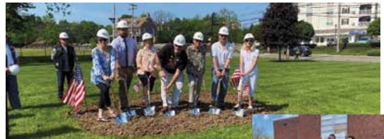
I was honored to attend the groundbreaking ceremony for Hatboro's Gold Star Garden. Thank you to the Borough and the community members who have come together to support this project, which will serve as a tribute to our fallen soldiers and their loved ones. The dedication ceremony is planned for September 25th at 11 A.M. at Miller Meadow Park.