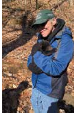
I made new furry friends in Western PA while helping the Game Commission tag bear cubs.